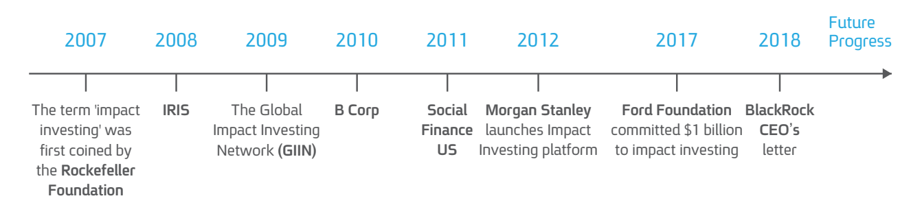
Figure 1: The US impact investing market evolution. (2)

The term "impact investing" was first coined in 2007 by the Rockefeller Foundation. According to the Global Impact Investing Network (GIIN), the formal definition of impact investments is investments made in companies , organizations , and funds with the intention to generate positive , measurable social and environmental impact alongside financial returns . Impact investing has become a legitimate and recognized investment practice among a small but critical mass of players and is being increasingly adopted by diverse types of organizations. The latest high-profile example is BlackRock, the world's largest asset manager, which announced in early 2018 that in order to receive investment from the firm, companies will need to demonstrate that they positively contribute to society <sup>(1)</sup>.