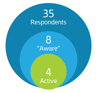
Figure 6: Israeli investors' awareness and activity (14)

There is room in Israel for raising awareness among investors. As shown in Figure 6, the awareness and activity of Israeli investors is low.